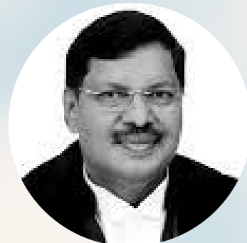
Hon'ble Mr. Justice B. R. Gavai Judge, Supreme Court of India